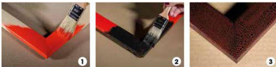
Crackle Spirit STEP 1

Tint STEP 1 and STEP 2 in custom colours! So with only two steps there is a result of cracked surface with STEP-1-coloured crackles in a STEP-2-coloured background.